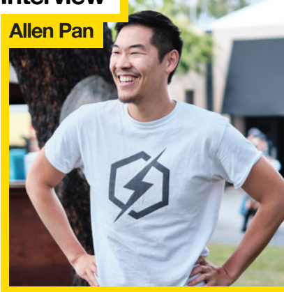
We let this man shoot us with